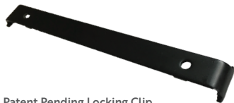
Patent Pending Locking Clip